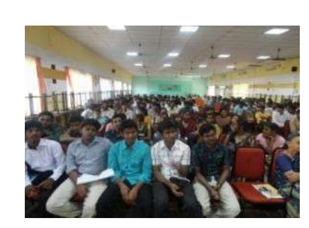
Personality Development Training